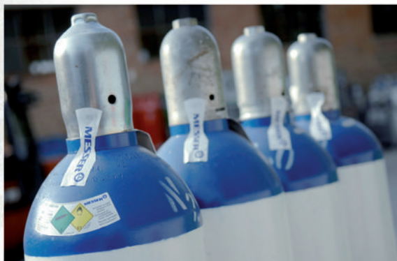
The environmental benefit of residual gas disposal is particularly marked with nitrous oxide.

Messer is one of the leading producers of industrial gases, with more than 60 companies operating in over 30 countries throughout Europe and Asia as well as in Peru. Its international operations are directed from Frankfurt, while the central technical functions of logistics, engineering, production and technology management are performed from Krefeld. Messer is the largest owner-managed industrial gas company, employing more than 4,200 people.