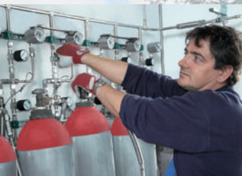
Cylinder handling in the Gumpoldskirchen plant in Austria.

Pure gases and gas mixtures are largely supplied to customers in rental cylinders. When the cylinder is returned after use, it usually contains a small residue of gas. In most cases, the cylinders have to be emptied completely before refilling or re-inspection. If the gases in question are toxic, flammable or environmentally hazardous, they are not simply released into the atmosphere but professionally disposed of.