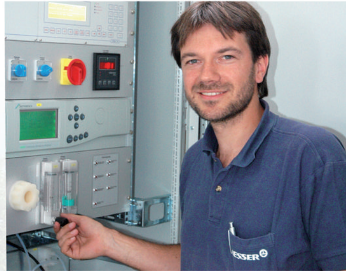
Disposal is fully automatic. Compliance with permissible emission levels is constantly monitored and documented.

When the cylinder is returned after use, it usually contains a small residue of gas. In most cases, the cylinders have to be emptied completely before refilling or re-inspection. If the gases in question are toxic, flammable or environmentally hazardous, they are not simply released into the atmosphere but professionally disposed of.