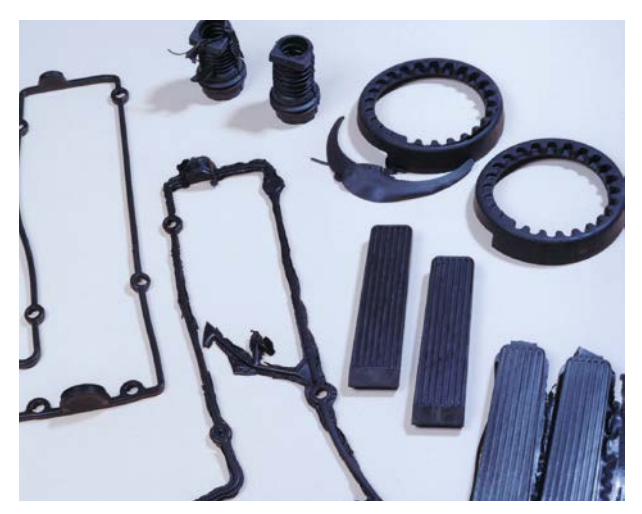
Rubber parts before and after deflashing