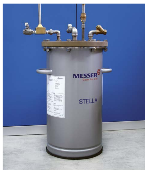
The subcooler enhances the nitrogen's cooling quality.