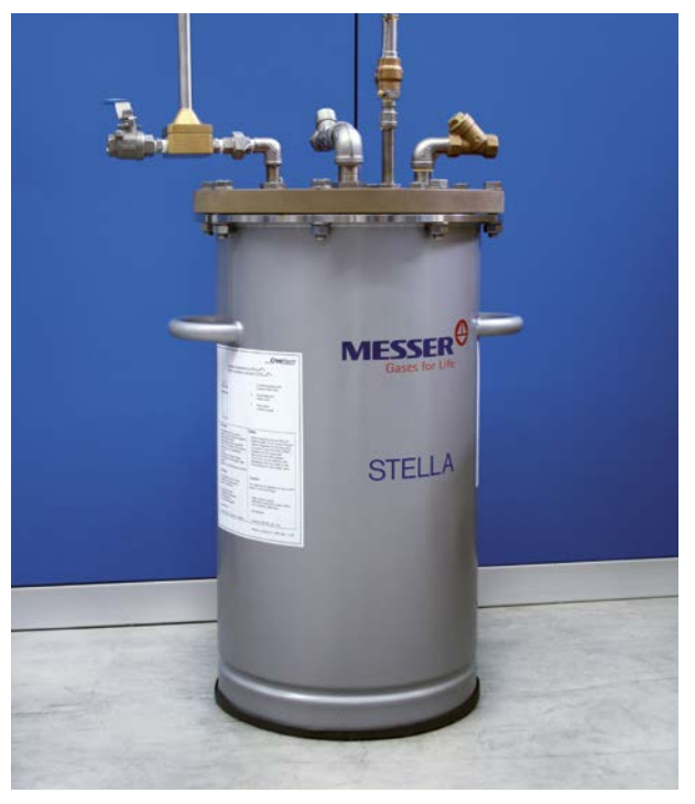
The subcooler enhances the nitrogen's cooling quality.